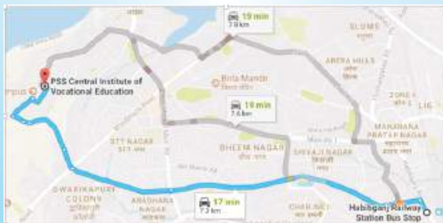
Habibganj Railway Station