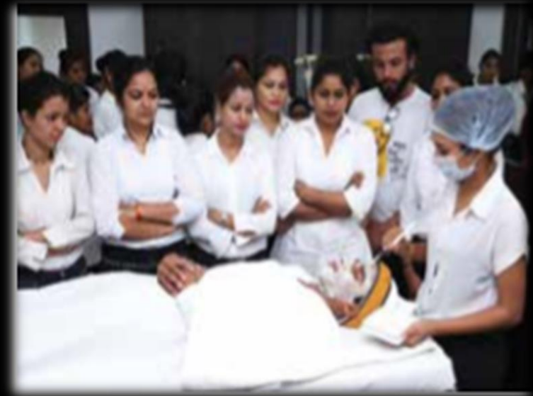
Bleaching of the face

Bleaching is done to lighten the colour of facial hair. Skin test should be performed before applying bleach to the whole face to avoid any skin reaction.