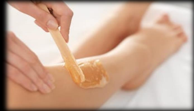
(b) Waxing of the leg