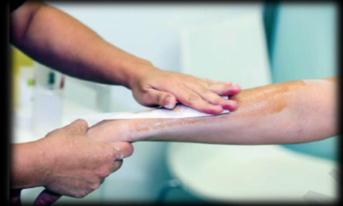
(a) Waxing of the hand