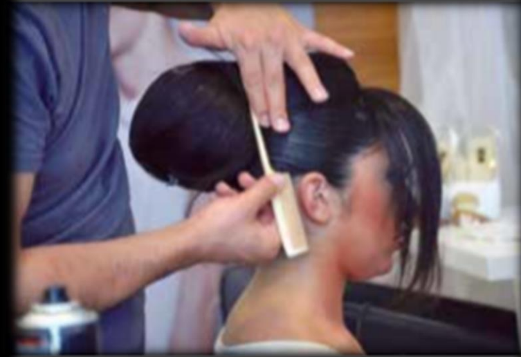
Making a hairstyle

A hairdo or hairstyle is a way in which the hair is styled. It is considered as an important aspect of personal grooming and fashion, and is popular among both men and women.