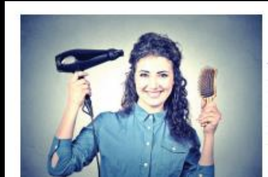
Curly blow dry

Curly blow dry: A section of the hair is lifted using fingers and air is passed through the hand from the diffuser just before clamping the fist. Mousse has an important role in this process as it helps to hold the style. It should be applied by turning the head upside down. In this style, the curls are not pulled, so straightening is avoided.