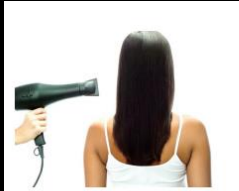
Smooth blow dry

Smooth blow dry: Blow drying is a simple method to give bounce to the hair. It is done to straighten the hair. Divide the hair into sections and pick one. Clip the rest of the hair and start working on that section. Roll the hair in a brush in a clockwise direction and use a hairdryer directly on it. Perform this type of blow drying on damp hair.